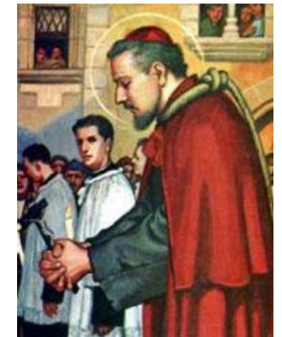
November 4 Patron of Seminarians and Catechists

Oh God, Maintain in your people that spirit with which you inspired your Bishop St. Charles, so that your church may be constantly renewed, conforming itself to Christ and manifesting Christ to the world.